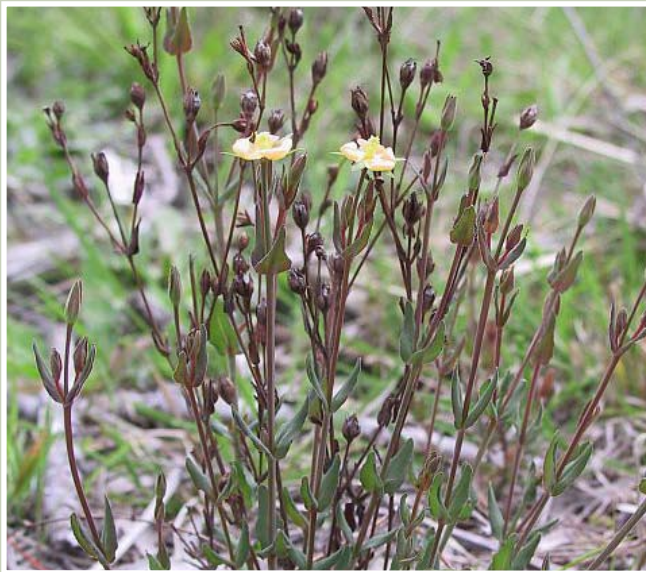
Native: small St John's wort