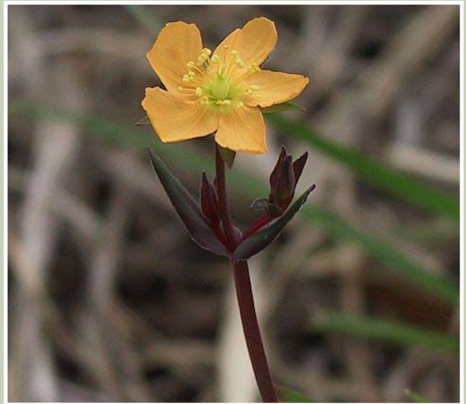
Native: small St John's wort