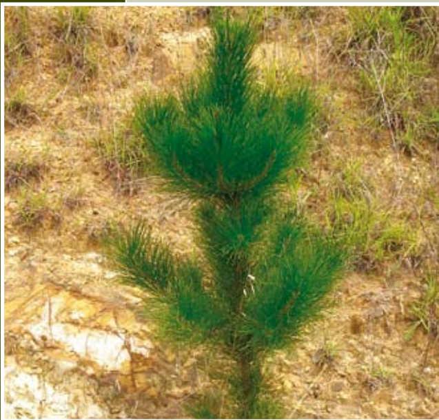
Weed: young radiata pine