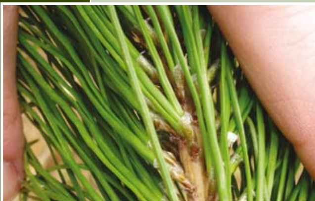
Weed: radiata pine.