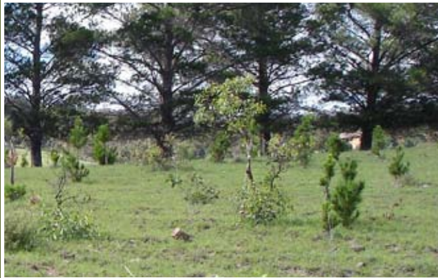
Weed: radiata pine seedlings spreading from a wind break planting