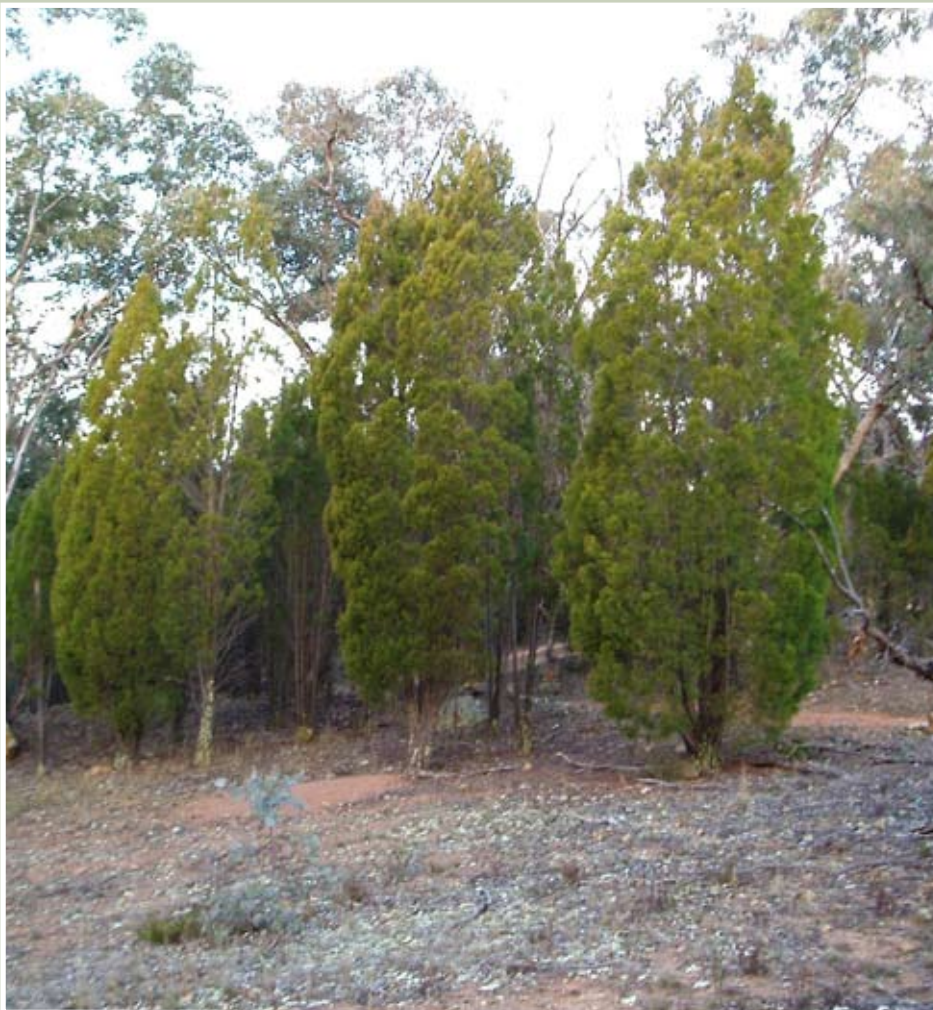
Native: black Cypress-pine

There a number of other similar plants, some of which are natives and should not be removed and some of which are also weeds. Black Cypress-pine ( Callitris endlicheri ) and cherry ballart ( Exocarpos cupressiformis ) are two native species that could be mistaken for radiata pine. Both these look-alikes can be differentiated by their aroma - neither have the distinctive pine perfume when the leaves are crushed. Cherry ballart has hard green fruit at the end of a swollen red fleshy 'stalk'.