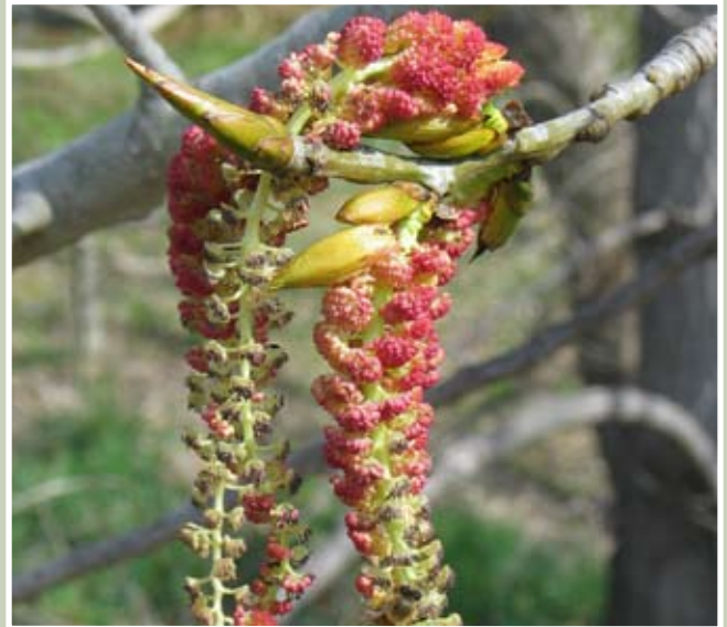
Cottonwood flowers or 'catkins'

Both white and Lombardy poplars have similar flowers (or 'catkins') to those of Populus deltoides , commonly known as cottonwood .