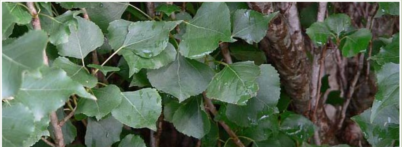
Weed: lombardy poplar