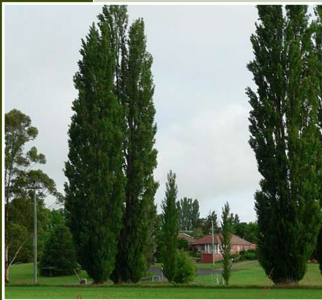
Jackie Miles/Max Campbell

Note the juvenile plants on the right The white underside of the leaves is clearly visible