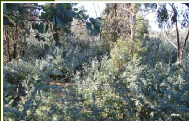
Weed: Cootamundra wattle infestation opposite HMAS Harman