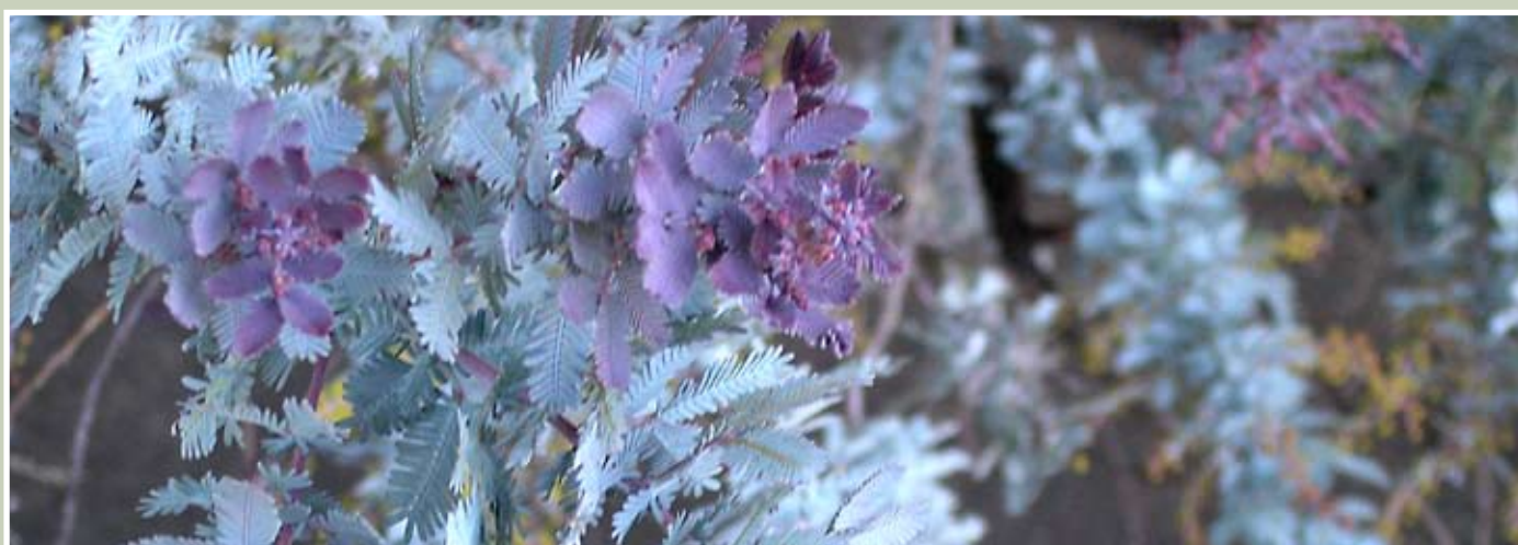
Weed: Acacia baileyana 'Purpurea'

Silver wattle ( Acacia dealbata ) is quite similar and should not be removed. A defining feature is that it doesn't have the backwards pointing pair of lower leaf pinnae. Silver wattle also colonises heavily.