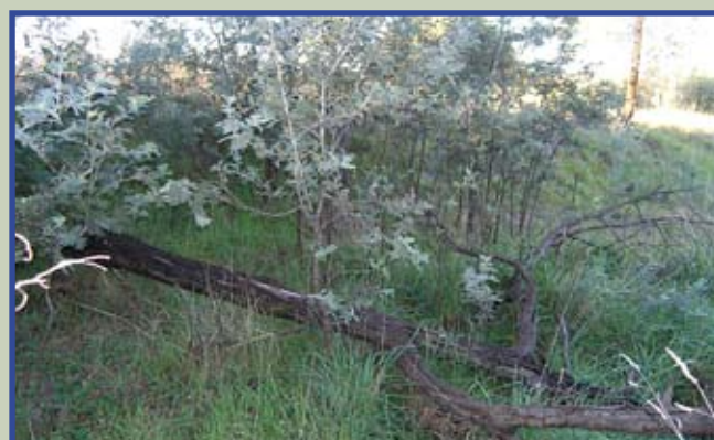
Native: silver wattle.

Note the similarity between this wattle and the Cootamundra wattle on the front page