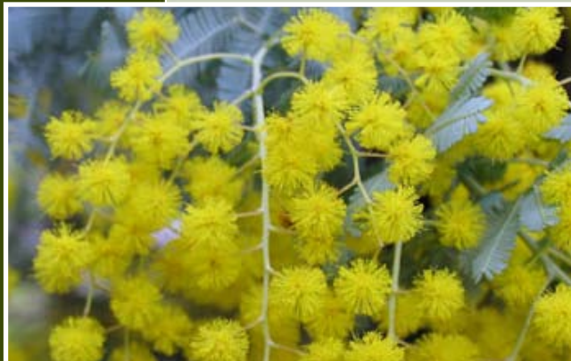
Weed: Cootamundra wattle flowers