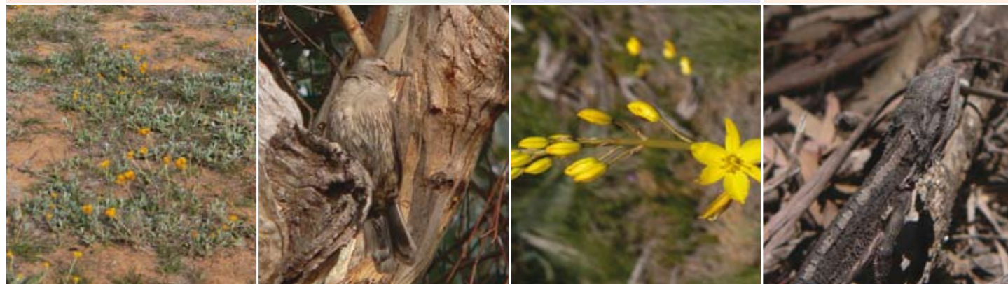
Section 1 Section 2 Section 3 Section 4

This planting guide for Burra Creek and tributaries has been produced to assist landholders and developers in making decisions about conserving what remnant native vegetation may be left, and providing a core list of indigenous and local species suited for rehabilitation or enhancement planting within the creek corridor and surrounds. It is one of a series produced by the Molonglo Catchment Group for catchments and sub-catchments of the Molonglo River. The planting guide has been prepared based on research and site visits to the Burra Creek at various points along its length.