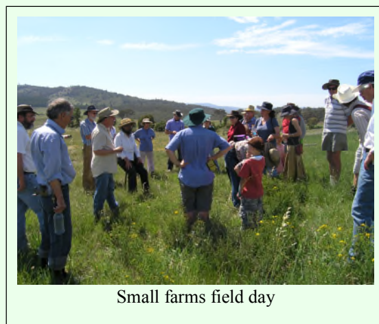
Small farms field day